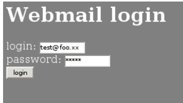
Figure 5: login

Now that we know how FreePOPs will act during the login we have to implement the login in the webmail, but first uncomment the few lines in the init() function (that is called when the plugin is started), that loads the browser.lua module (the module we will use to login in the webmail). Here is the webmail login page viewed with Mozilla and the source of the page (you can see it with Mozilla with Ctrl-U, figure 5).