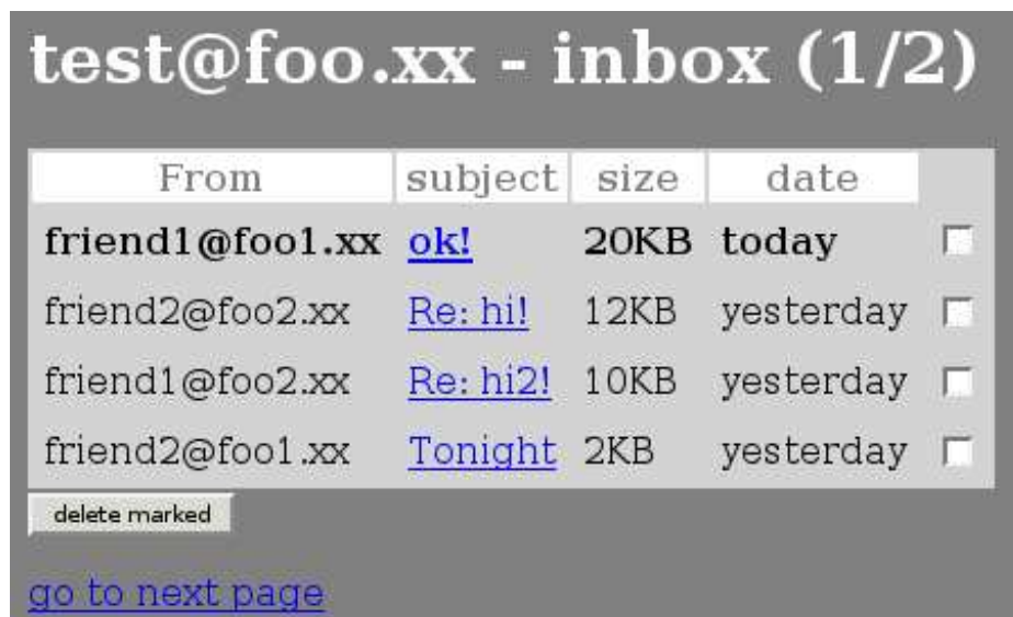
Figure 7: inbox

<form name="inbox" method="post" action="/delete.php"> <input type="hidden" name="session_id" value="ABCD1234"> <table> <tr><th>From</th><th>subject</th><th>size</th><th>date</th></tr> <tr> <td><b>friend1@foo1.xx</b></td> <td><b><a href="/read.php?session_id=ABCD1234&uidl=123">ok!</a></b></td> <td><b>20KB</b></td> <td><b>today</b></td> <td><input type="checkbox" name="check_123"></td> </tr> <tr> <td>friend2@foo2.xx</td> <td><a href="/read.php?session_id=ABCD1234&uidl=124">Re: hi!</a></td> <td>12KB</td> <td>yesterday</td> <td><input type="checkbox" name="check_124"></td> </tr> </table> <input type="submit" value="delete marked"> </form> <a href="/inbox.php?session_id=ABCD1234&page=2">go to next page</a> </body>